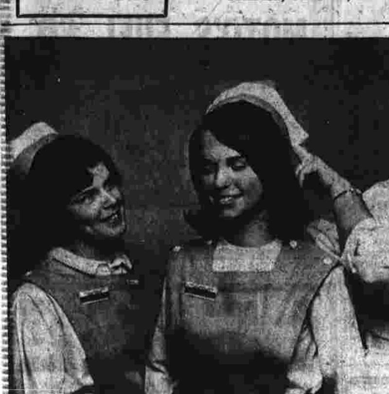
32 Pinkies Given Caps

They have metelwood with the years and should be preserved for this generation to admire and enjoy and for future generations to bring part of the past to them. We talk about our "City of Village Charm" and we are all proud of it, so why not issue a small historical booklet dedicated to the most interesting part of the town. I am sure many of the old timers would be happy to supply many of the facts necessary for such a booklet. A committee could sort and compile these which could be distributed by the Chamber of Commerce to transients and also to property owners. We could give a new look to old Manchester. In Feb. 11, 1964 Manchester Herald I made a plan to preserve historical houses or at least place markers at points of interest. Old local places should be recognized as records of the past and should be stored as part of our historic heritage. Are they going to be forgotten or preserved? Call Roberts Village Charm Antiques.